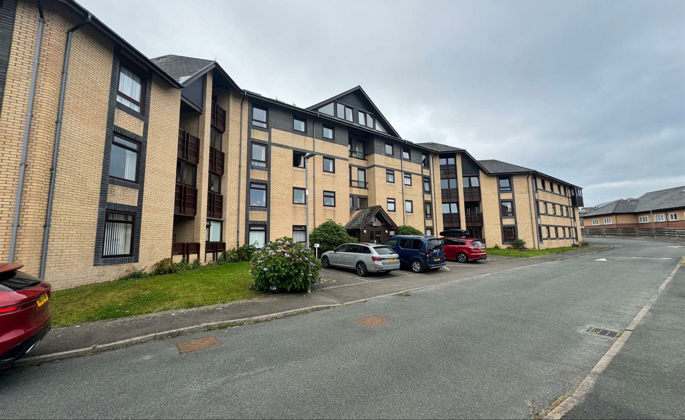
32 Gerddi Rheidol, Trefechan Aberystwyth Ceredigion SY23 1DB Guide price £175,000